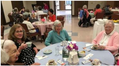
Special Ladies enjoying the Ladies Tea

We have all been blessed to know special women in our lives who in one way or another have contributed to the formation of who we have become. For many, it is the