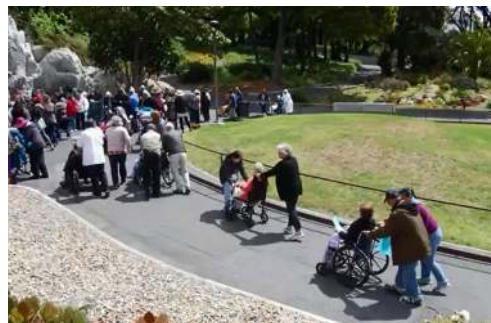
Scenes from the Pilgrimage