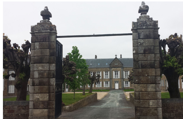
Entrance to La Tour St. Joseph, Motherhouse of the Little Sisters of the Poor in St. Pern, France

as the site where St. Jeanne Jugan performed her charitable works and for its lovely shops and restaurants. The first Home of the Little Sisters of the Poor sits