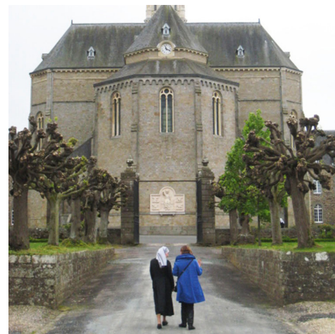
The peaceful path to the chapel on the grounds of the Motherhouse

as the site where St. Jeanne Jugan performed her charitable works and for its lovely shops and restaurants. The first Home of the Little Sisters of the Poor sits