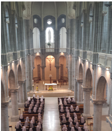
Sisters at prayer in the chapel at La Tour

The region of Brittany in Northwestern France is bordered by the Atlantic Ocean to the West, the English Channel to the North, and the Bay of Biscayne to the South. It is home to picturesque beach communities with breathtaking coastal views and fishing ports, as well as inland woods and towns preserving their Celtic roots and traditional 15th century architecture. Importantly, it is also the birthplace of St. Jeanne Jugan and home to the Motherhouse for the Little Sisters of the Poor. This Spring, my husband and I had the pleasure of visiting this wonderful part of the world and sharing time with the Little Sisters that was rich in