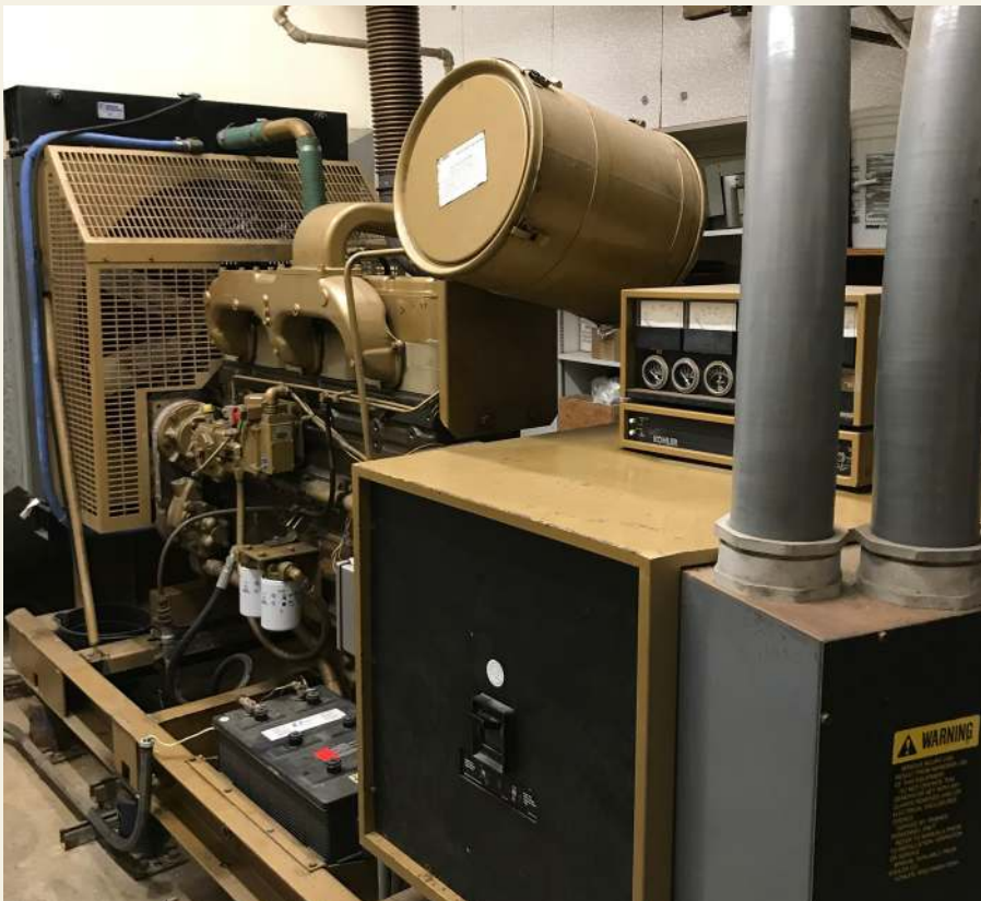
Our 35-year old generator has served us well, but is in need of retirement in 2018.

Thank you for your support in helping us reach our goal!