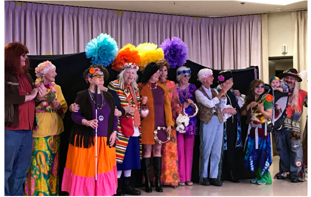
Special thanks to the Archbishop Riordan High School Drama Department for sharing their colorful fashions with us