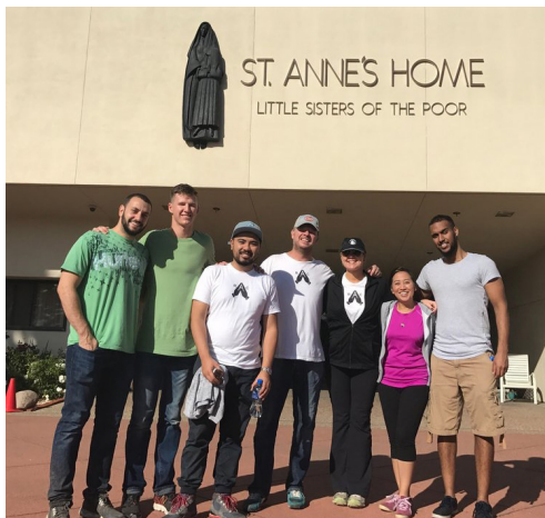
Random Acts of Catholic Volunteers ready to take on the job at THE WALL.

Our volunteers lighten our burdens in many ways and brighten our days with their generous hearts and their helping hands. It is our privilege to serve our elderly, and having our volunteers join us in our journey is a gift for which we are truly grateful.