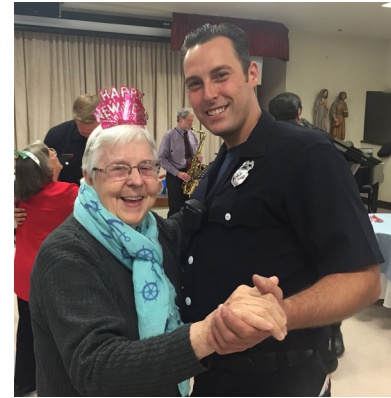
Residents celebrating with their San Francisco Fire Department escorts.

fighters would join us in our annual St. Joseph's Day celebration, assisting with food preparation and the Residents' meal service. That tradition has evolved into their most welcome presence at our annual New Year's Eve celebration, where they escort our Residents onto the dance floor.