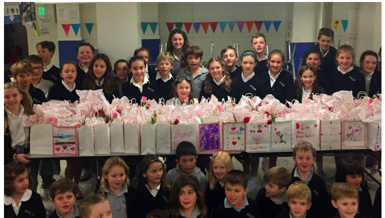
St. Vincent de Paul 5th Graders and their special Valentine's Day gifts.