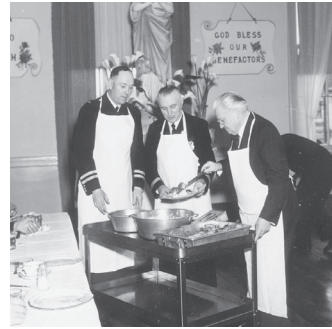
St. Joseph's Day Celebration with the San Francisco Fire Department.

Time spent with friends, enjoying good food, good music, and maybe a little dancing — a suitable description for a great New Year's celebration. That is how our Residents rang in 2017! Many of them described the evening as "one of the best parties we've had." They enjoyed savory treats, the company of the San Francisco Fire Department's finest, and music by Second Opinion, who raised the spirits of all of our Residents with a lively selection of music that even brought the majority of them to their feet for a conga-line dance.