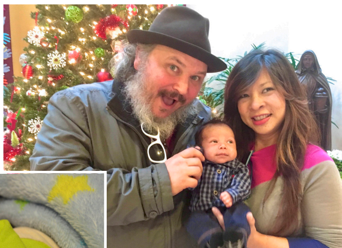
Mom, Dad and Baby on their first visit to St. Anne's.